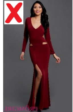
Cleavage, cutouts, slit