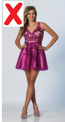
Too short, sleeveless