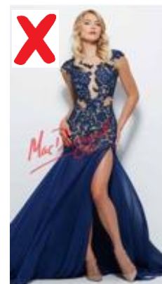
Sheer fabric, high slit