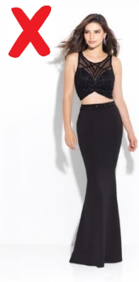
Sleeveless, bare midriff