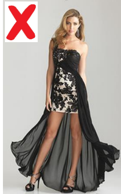
Strapless, too short