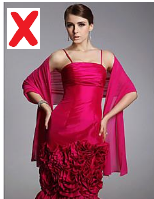
Spaghetti straps; shawl