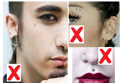
Facial hair. Facial piercings not allowed for any gender. Boys may not wear earrings.