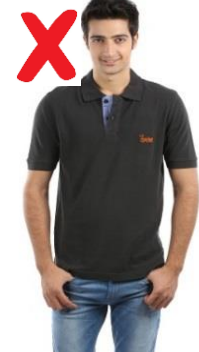
Casual dress, polo shirt